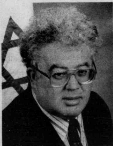
Israel COUNSUL General Arye Mekel

ing Authority, in charge of television and radio broadcasts throughout Israel. He was appointed Consul General of Israel to the Southeastern United States in April 1993.