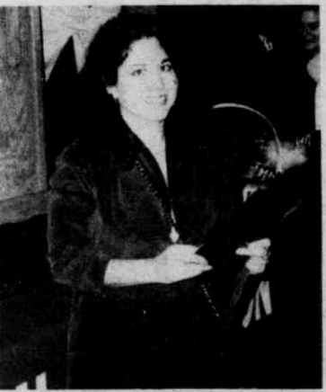
A happy grand prize winner of a round trip ticket to anywhere in the continental U.S., donated by Mann Travel