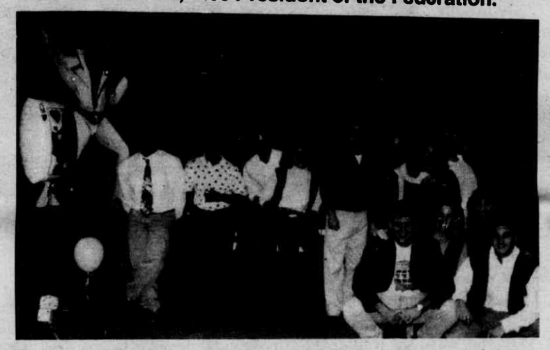
The New Federation Generation Committee celebrates their successful Las Vegas party night