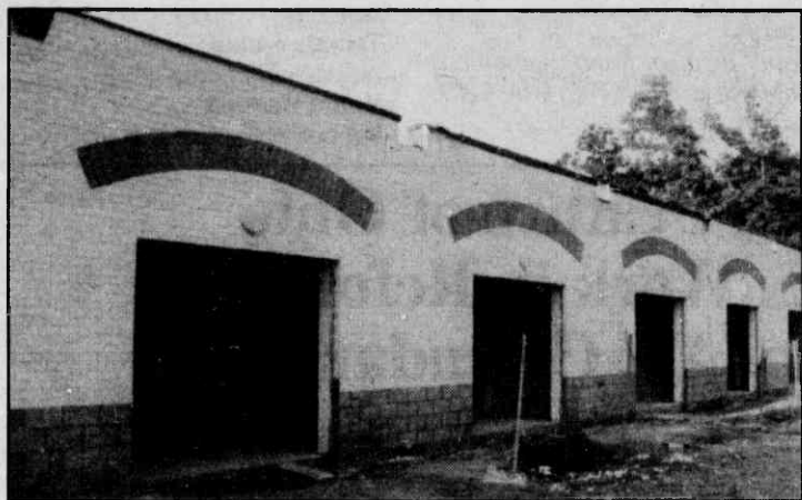
New building at Sardis to be completed in August 2000.

What lucky children! They have the newest and the best! ✧