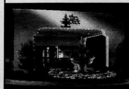
The Park... The Heart of SouthPark

Charlotte's only Four-Star, Four-Diamond hotel proudly invites you to join a tradition of elegant, intimate celebrations.