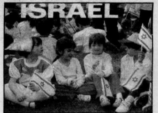
The whole family can celebrate Israel on Family Fun Day.

The Israel Family Fun Day program will offer a range of activities for the whole family, complete with a kibbutz, a mock bar/bat mitzvah in "Jerusalem," a "Dead Sea" Therapy Center with beauty treatments, an archaeological "dig" at "Masada," a "climb"