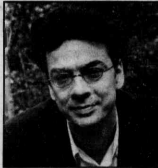
Stephen Dubner, Festival Keynote speaker at the Gorelick Family Lecture, November 15.

One of the most dramatic events will be keynote speaker Stephen Dubner's lecture, sponsored by the Gorelick family. On Wednesday November 15 at 7:30 PM at the Great Aunt Stella Center, the author will share his riveting story. Stephen Dubner has traveled a path that most people discovering their Jewish roots don't experience. Raised by devout Roman Catholics, Dubner learns in his 20s that his parents were in fact Jews, who had converted to Catholicism as young adults during the tumultuous pre-war 1940s in Brooklyn, N.Y. Thus begins Dubner's own search for his spiritual identity, a journey chronicled in his 1998 best selling book, Turbulent Souls: A Catholic Son's Return to His Jewish Family . A musician and a journalist in New York before writing his best-seller, Dubner had been dis-