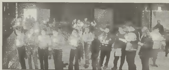
The rally concluded with a candlelight vigil.