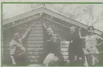
Building a house for Habitat for Humanity at MD 2000.

Here are the projects available for Mitzvah Day. Sign up now!