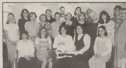
The "stars" of the Teacher Appreciation Luncheon.

event which also included door prizes and special gifts to each guest-a plush monogrammed terrycloth robe, a personalized facial basket, and a long-stemmed red rose. Everyone left the luncheon feeling like an Academy Award winner. ☆