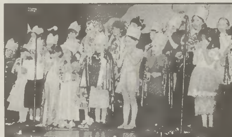
The Kindergarten class.