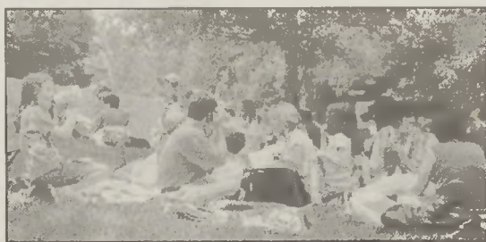
Parents enjoying a picnic lunch with their children at Lag B'Omer Field Day.

This year's Lag B'Omer holiday gave our students an opportunity to enjoy field games and outdoor activities. Parents were invited to bring a picnic lunch to share with their children before the games, and then to cheer the students on as they participated in the various events. This holiday is such a highlight of the school year that a previous graduate expressed how much she would miss it.