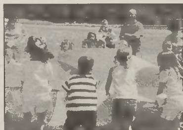
Children enjoying "crane toss" activity at Lag B'Omer Field Day.

The theme of this year's celebration was "Traveling to Israel." Students received "passports" that were stamped as they proceeded through eighteen activity stations set up on the track field beside the Jewish Community Center. Every activity had to be performed in order to "get to Israel." The students "landed" in Tel Aviv and raced to put on items of clothing while navigating an obstacle course. At another station, children tried to "stump the rabbis" with questions about various