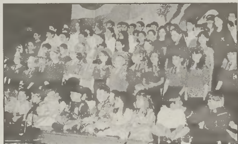
CJDS students at graduation 5761.