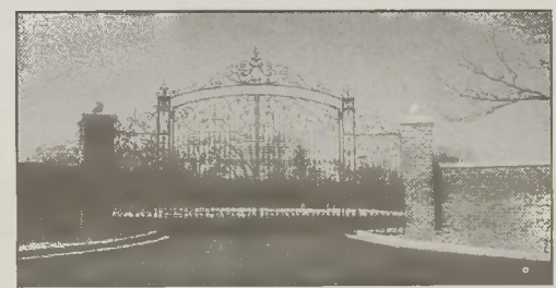
The gate to the Hebrew Cemetery.

* Last but not least, by giving this small amount you can honor the generations of yesterday and at