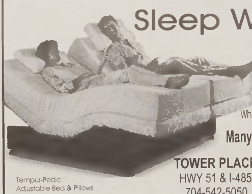
Tempur-Pedic Adjustable Bed & Pillows

Many Sizes In Stock For Immediate Delivery.