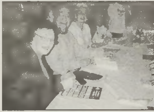
Residents of the Carriage Club enjoy Chanukah Jingo.