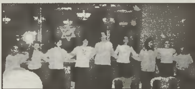
Children performing Chanukah songs.

"You girls don't even realize how happy and thankful we are that you all came to perform and