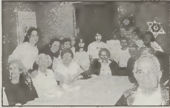
The children greet the residents after their performance.

"I really had fun playing that Chanukah Jingo game. It was a good review of its history and miracle for me," said a happy resident as she hugged and kissed one of the girls.