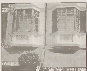
Jewish influence is readily found in this small city, as evidenced by the Star of David on buildings in Gibraltar.

No trip to Gibraltar would be complete without visiting the famous Rock. The large Upper Rock Nature Reserve, which covers most of the upper rock, has spectacular views and several interesting spots to experience.