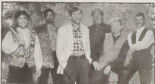
North Tower is the musical entertainment.