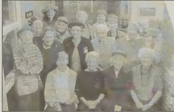
The Red Hat Yentas

Its purpose is to empower women over the age of 50 who have "behaved" for a better portion of their lives. According to the non-laws of the Red Hat Society, it's time for these societal