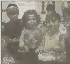
The three-year-olds at the Jewish Preschool on Sardis iron in preparation for Shabbat.

The Jewish Preschool on Sardis, less than a mile from Shalom Park, is open to all Jewish children and provides a warm, happy environment where each child's unique style of living, learning, and developing is valued and nurtured. The Jewish values that are shared include honoring parents, sharing with friends, treating each other with respect, and giving to or helping those less fortunate than themselves. The Jewish Preschool on Sardis recently was awarded a two-year grant from Smart Start of NC that provides the Preschool with technical support, program assessments, consultations, professional evaluations, and administrative assistance. They also have a new playground thanks to the preschool families and other important donors.