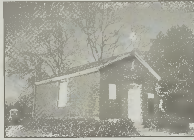
The chapel at the Hebrew Cemetery.

Society of Charlotte from purchasing eleven acres of land off of Statesville Road which were consecrated as a holy burial ground