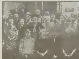
The Red Hat Yentas are among the older adults served by JFS.

Unemployment and financial difficulties seem to be a major rea-