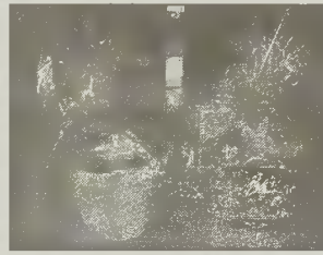
Mitzvah baskets make nice decorations or centerpieces for your next event.

son JFS is called. Although this is one of the oldest components to the agency's list of services, in January of this year, JFS expanded and formalized its Vocational Program to assist those unemployed or seeking a career change. A part-time Vocational Counselor was hired to assist with job place-