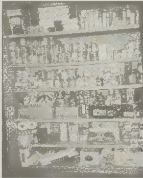
The JFS Food Pantry is ready for clients to come anytime.

In 2005, JFS impacted the lives of more than 2,000 individuals and families in our Jewish