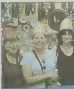
Teachers from the community visit Israel thanks to the Charlotte Jewish Federation.