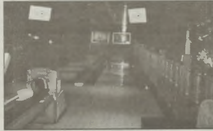
The bowling alley on board