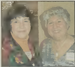
Ladies' Night Out

Sponsored in partnership with the Levine JCC.