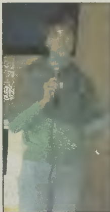
Bernstein Leadership Group.