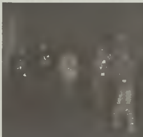
Opening night Havdalah service.