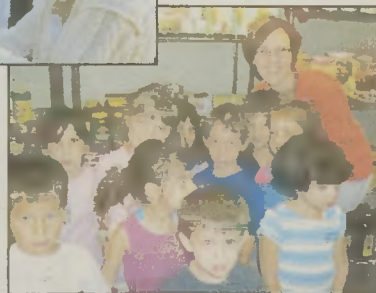
The Charlotte Jewish Preschool visits the Food Pantry.