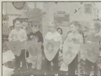
The boys sing Judah Maccabee.

Every family that passes through the doors must be astounded at what their child has accomplished. We thank CJP for laying the groundwork for their academic careers. We also thank CJP for giving our children the confidence to explore, the desire to learn and the self reliance to succeed in their next adventure. This Simcha is without question a huge milestone in their short five years on earth. As we go our separate ways to our different schools, we know as parents that our children have a special advantage over their future classmates- The "CJP" advantage. Now, start saying for those B'nai Mitzvah. ☆