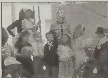
A double "wedding" under the chupah.

How wonderful and exciting this time is for your child and for you. We know that as we send them into the big world, we have given them the best gift a parent can give: A solid foundation- provided by our loving care, our parental guidance and the Charlotte Jewish Preschool. The partnership that we as parents and the faculty at CJP have embraced over the years is one that cannot be surpassed. Collectively we have instilled in them a sense of pride for their Jewish heritage, and have taught them decision making skills that will last a life-