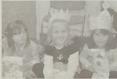
Purim at the Charlotte Jewish Preschool.

Make yourself a nice refreshing glass of iced tea. Find a comfortable, quiet spot- perhaps that overstuffed chair in the den, or maybe that creaky rocking chair that has been in your family for years. Close your eyes. Listen closely, and you can hear the chatter: It's a boy! It's a girl! Congratulations! Mazel Tov! Now, fast forward (and I do mean FAST forward) to 2007-you can hear some of the same rhetoric -Congratulations! Mazel Tov! Only this time, your babies are graduating from CJP and going to Kindergarten. Is that possible? How have five years gone by so quickly? "Why, it was just yesterday that my little one started to....."