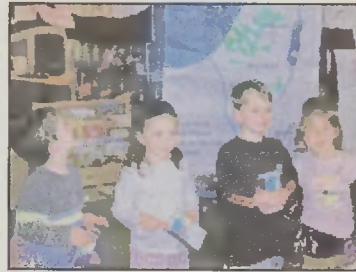
Kids from the Jewish Preschool on Sardis with their blue boxes.

We would like to thank the Charlotte Jewish Preschool and the Jewish Preschool on Sardis,