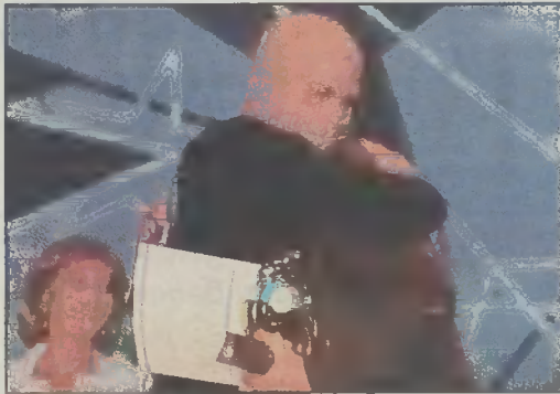
Writer and director Eyal Halfon, winner of the best screenplay from the Israel Film Academy and the Golden Dolphin for best film at Festroia-Troia International Film Festival, will be in Charlotte for the opening night of the 2008 CJFF.

The fourth annual Charlotte Jewish Film Festival is coming March 1-8, 2008. We are pleased to announce two very special events that will be kicking off the festival this year: