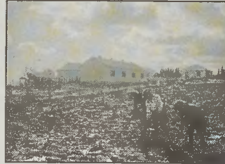
Making Hadera green in 1935.

"Accordingly, we, the members of the National Council representing the Jewish people in the Land of Israel and the Zionist Movement, have assembled on the day of the end of the British