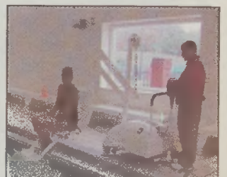
The new pool lift in action.

Aquatic Lift that helps special needs swimmers into and out of the pool. This lift was custom made specifically for our facility and took over four months to build. The lift arrived in late October and is available for use at specific times. Please contact Aquatics Director Peter Perers for more information on use of the lift and availability, 704-944-6745. ☆