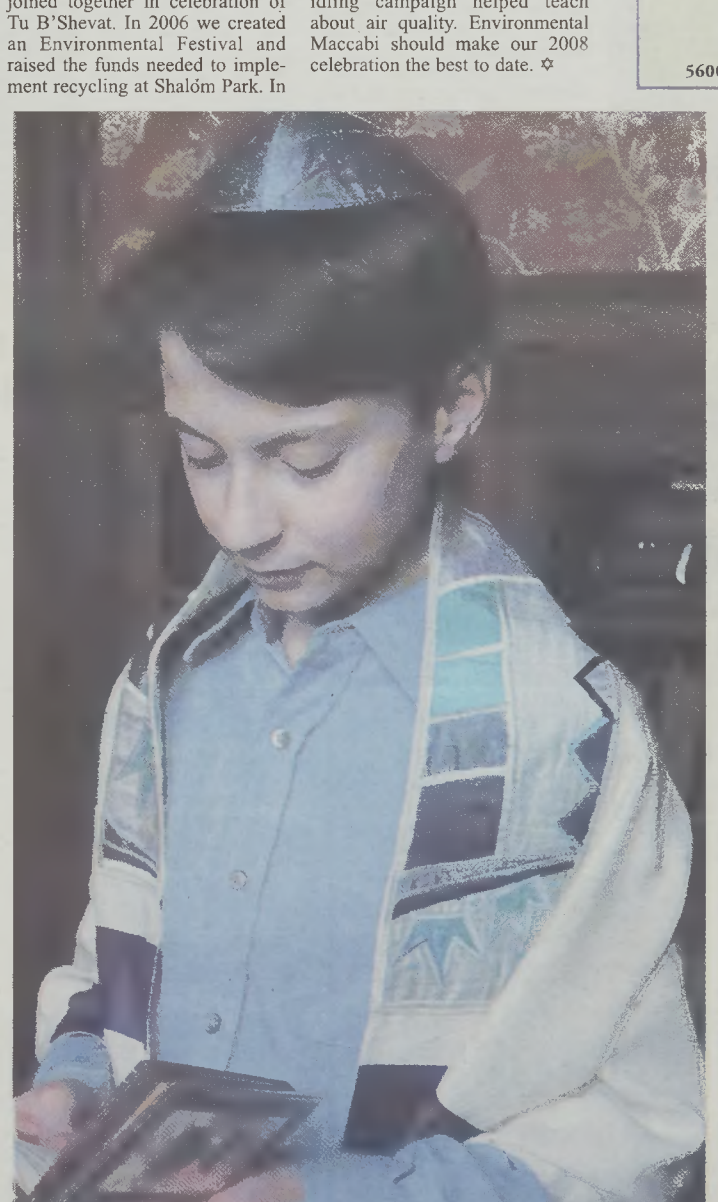
This day is all about you.

2007 our activities led us out to the carpool lines, where our antiidling campaign helped teach celebration the best to date. $\Phi$