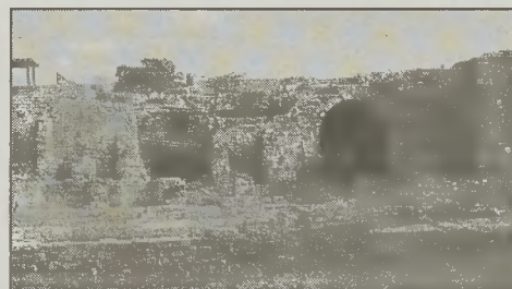
The Roman ruins at Caesaria.