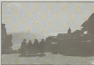
The beach at Caesaria.

This July, the Jewish Federation of Greater Charlotte invites women from our community to join us in a mission of sisterhood together with women from our sister city of Hadera, Israel. We will spend five days in Poland and five days in Israel, learning together and experiencing both our history and our homeland.