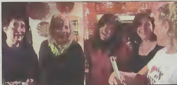
Mixing the dough at the Challah Baking Luncheon.