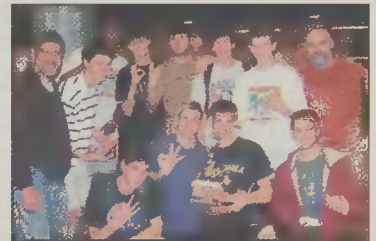
The championship basketball team.

Our Charlotte team finished with a record of 4-2, with preliminary round wins over Louisville (54-47) and Pittsburgh (56-47) and playoff round wins over Pittsburgh once again (55-53) and an overtime thriller to clinch the 3rd place trophy over Jacksonville (54-53). The teams' two losses were to the eventual runner-up team from Dallas and the eventual tournament champion from Miami.