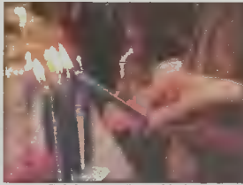
Celebrating Hanukkah at Congregation Or Olam

The religious school students are also participating in a