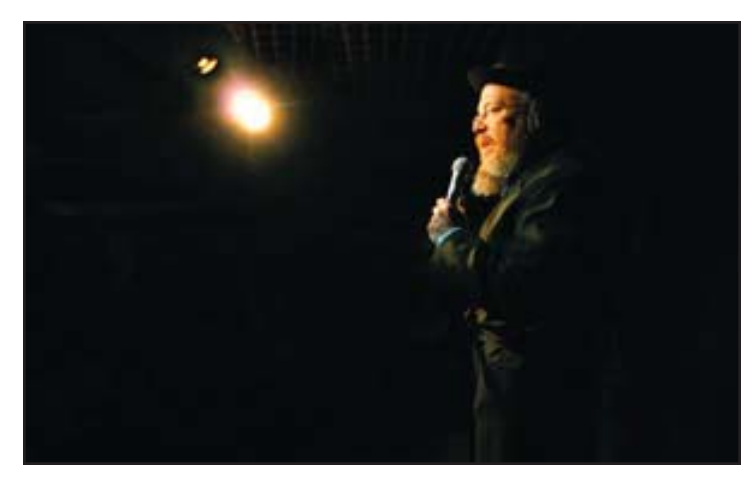
Yisroel Campbell in "Circumcise Me."

Following the screening of Circumcise Me, four additional shorts will be shown including West Bank Story, the 2007 Academy Award winner for Best Live Action Short. A take-off on West Side Story, it is the hilarious story of rival falafel stands in the West Bank, one Israeli-owned, the other Palestinian. 1-800 Kosher, A