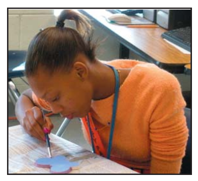
Students at Barringer Elementary School contributed to the Butterfly Project.

collaborative project created by students, families, community organizations, and over one hundred Holocaust survivors. A large tree stands as the focal point of this larger-than-life piece of art with the butterflies radiating out in all directions in waves of simulated flight. The butterflies remind the community to remember the past, act responsibly in the present and create a more peaceful future.