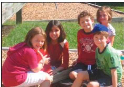
Friendship Circle kids and their buddies.

This spring the Friendship Circle will be launching a B'nai Mitzvah training program that will educate young adults on the challenges of people with special needs. The training program will meet for six consecutive Sundays which will include: Weekly disability awareness, Jewish themes, hands-on training for working with special needs, and loads of exciting multimedia activities. Young adults that complete the course will receive certification