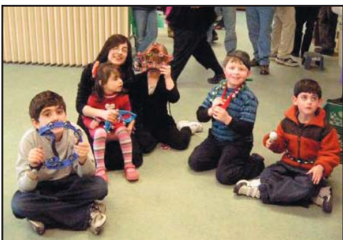
Having fun at a Friendship Circle event.

For more information contact us at 704-366-3984 or info@friendshipcircelenc.org. ✪