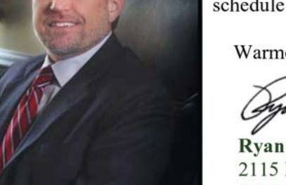
mind knowing their strategies are consistent with their values and objectives. I encourage you to contact us to schedule a complimentary visit!

I provide counsel so that my clients have the peace of