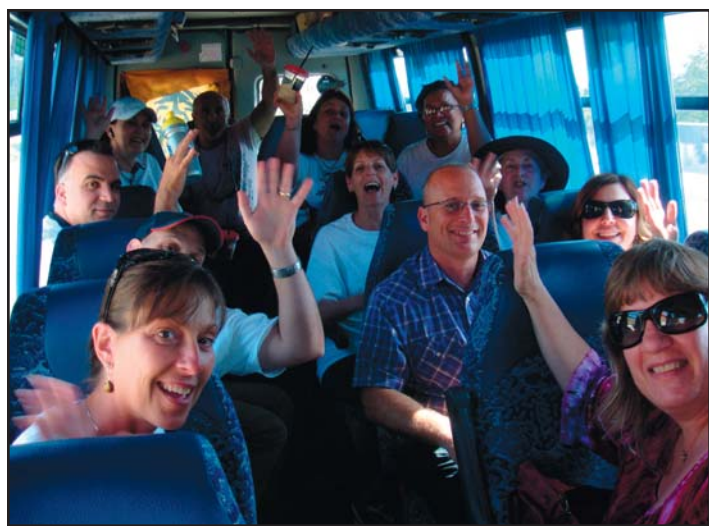
Israelis and Americans having fun on the bus during the P2K Steering Committee trip to Hadera.

1 in 7 drivers is uninsured. Are you covered if one hits you?