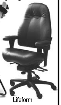
Lifeform Office Chair