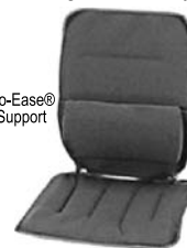
Sacro-Ease® Car Support