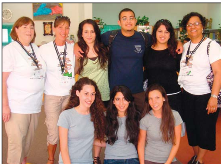
The P2K Steering Committee with their counterparts from Hadera.