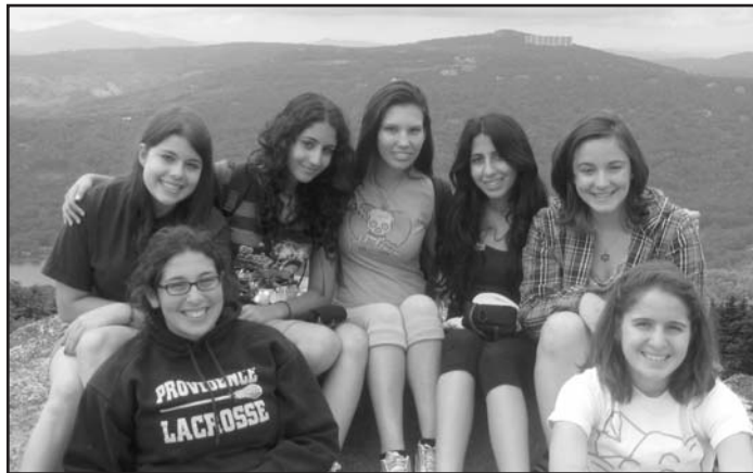
The girls from both Charlotte and Hadera had fun together and created lasting bonds this summer.