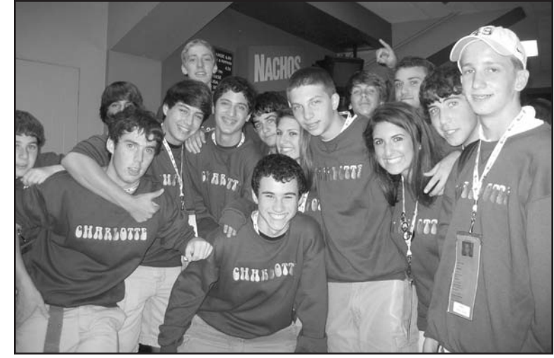
Team Charlotte is ready to compete.

Next year's JCC Maccabi Games will be held in either Richmond, Denver, or Omaha, the week of August 1-6. As of this writing, we are unsure what our allotment total will be as mandated by the national office or where we will be going. Once the allotment number is established and known, we will begin to get organized with the first informational