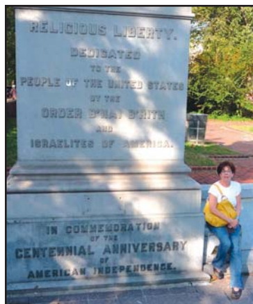
At the religious liberty monument.

This amazing vibrant city is filled with wonderful museums, fabulous restaurants, amazing shopping and a first class zoo located in Fairmont Park. We did get to visit the zoo which is the nation's oldest and a child's paradise. Philadelphia intrigued me and I know that I will be back for a longer visit. It's a city that is a wonderful combination of the old mixed with the new. ☆