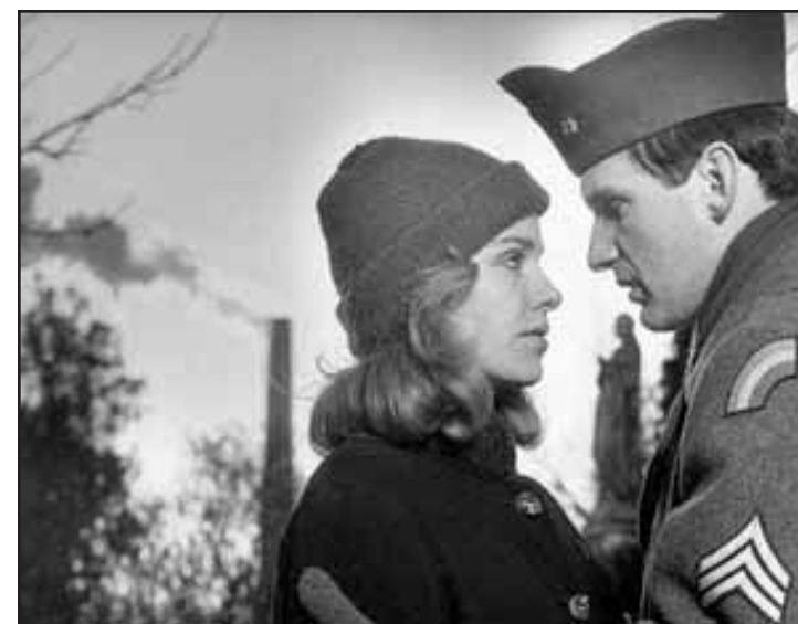
"Welcome to Vienna"