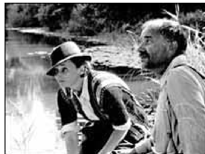
"God Doesn't Believe in Us Anymore"