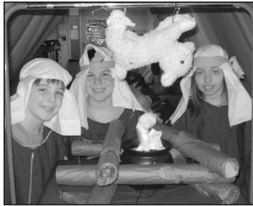
The Israelites roasting the sacrificial lamb.

The trick for the Judaica instructors of Charlotte Jewish Day School was how to bring these stories to life for students and parents alike. With a little cre-