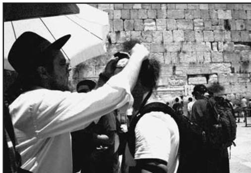
Laying tefillin at the Kotel.

See page 38 for details about the NC Hillel Campus Birthright Israel Experience - Winter 2010.