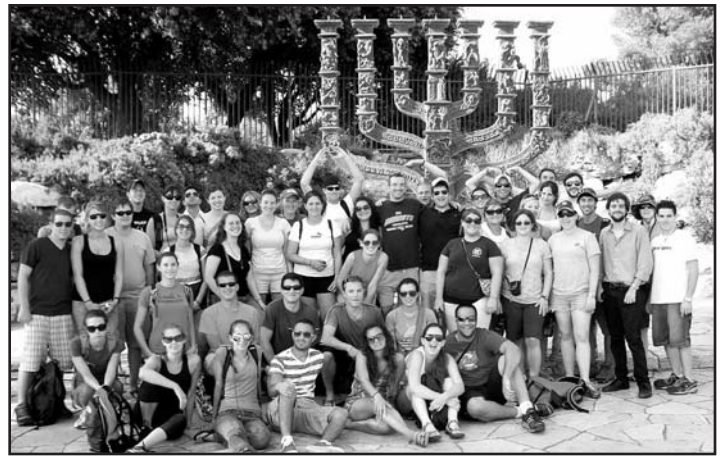
The group from Charlotte in front of the Knesset.

The Negev desert was filled with heat, but also with camel-riding, canyon-hiking, (and World Cup Final watching – you know you're jealous) fun. We traveled from there to Arad, where we held a beautiful outdoors Bar/Bat Mitzvah ceremony for our trip-mates who had not experienced one before. They