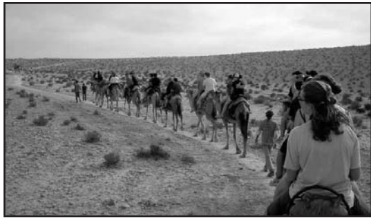
Riding camels in the Negev.

A special thank you to The Leon Levine Foundation for making this trip possible.