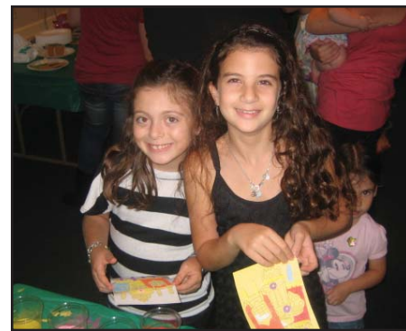
Making sand art was part of the Sukkot fun at Chabad of Ballantyne.