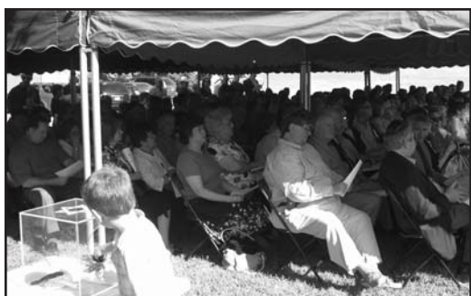
At the Hebrew Cemetery's annual meeting, September 12, more than 300 participated in a cross-denominational memorial service for the High Holidays.