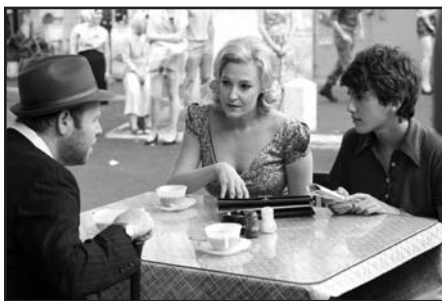
A scene from "The Matchmaker."

As the weather turns cold, the Charlotte Jewish Film Festival heats up. Although this year's Festival is already warming up with several free movies via the Charlotte Jewish Film Society, we will really turn up the heat in March when the Festival is in full swing.