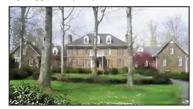
Complete information at: www.908Reverdy.com

A unique opportunity only 10 minutes to Shalom Park