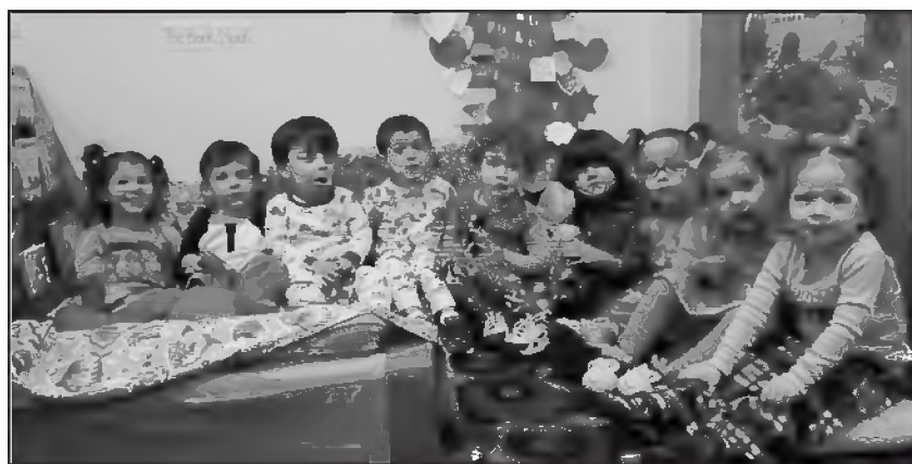
Dressed up for Pajama Day.

( P .s. – see how many " P "s your child can find after P erusing this article and then, "like" the Charlotte Jewish P reschool on Facebook. Tell us on Facebook how many P s you found. The first 50 "Likes" will receive a CJP car magnet.) ☆