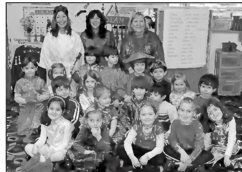
CJP celebrates Chinese New Year.

The letter P started off the month of February with a Dragon Parade P rominently P ut on by the P reK class. The whole school watched as the rich costumes, dancers, P arasols, and dragons floated through our hallways, as P reK celebrated their week long study of China and the Chinese New Year. The letter P did not stoP at the P arade, but continued the following week with P ajama Day. Children, teachers, sP ecialists and staff showed uP for school wearing their favorite P Js and sliPP ers. P arents helP ed us along as we P articipated in a sP ecial round robin and ate delicious P ancakes. The letter P con-