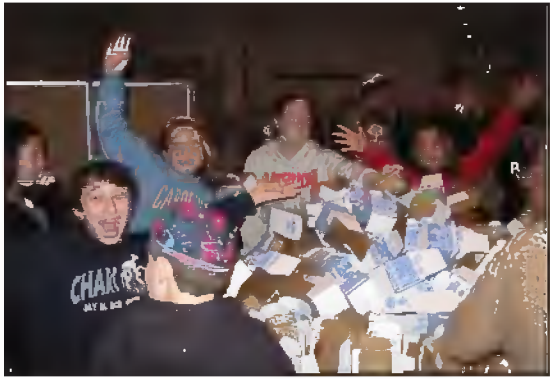
Mechina Program students and parents assemble packages in March 2011 for the annual Yizkor Candle mailing.