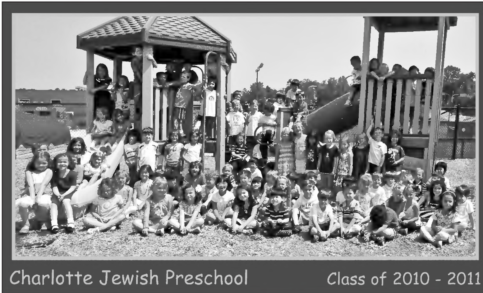
Charlotte Jewish Preschool