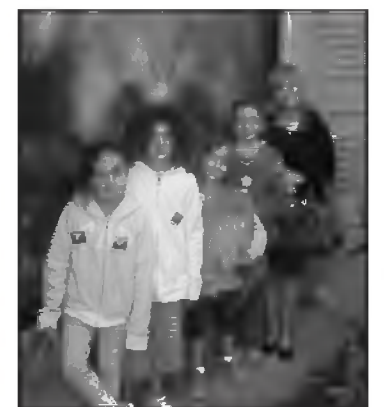
The 2nd grade class at the Atlanta Zoo

Charlotte Jewish Day School students participate in many exciting field trips during their years at the school, particularly in the spring. Second graders went to Atlanta on their first overnight trip with CJDS. Special stops in Atlanta include visiting their pen pals and having lunch at The Greenfield Academy, touring the Georgia Aquarium, and sleeping with the pandas at The Atlanta Zoo. The Schiele Museum of Natural History in Gastonia is the overnight destination for our third grade class. Students enjoy all the museum's indoor and outdoor exhibits and spend the night under the stars in our area's only Planetarium. As part of their studies of North Carolina, the 4th grade class visits Raleigh to experience our state's capital in action. The 5th grade camping trip is one that every CJDS student looks forward to. Two nights in the Nantahala National Forest - a ropes course, whitewater rafting, building their own tents and fires, and preparing their own food - makes this trip a tremendous experience that the kids talk about for years.