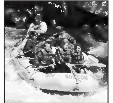
A group of fifth grade students white water rafting on the Nantahala River