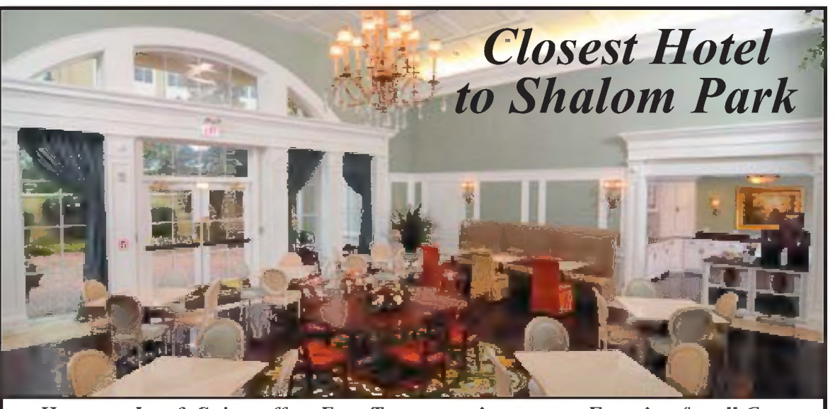
Hampton Inn & Suites offers Free Transportation to your Function for all Guests